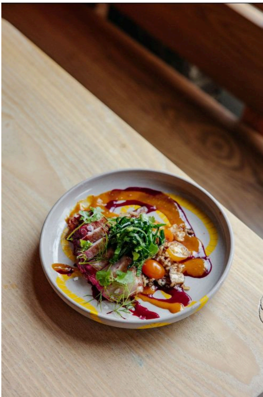
Little Bear is a hyper-seasonal neighborhood restaurant in Summerhill aiming to make fine dining more approachable, affordable, and casual, with a focus on sourcing exclusively local ingredients from farms around